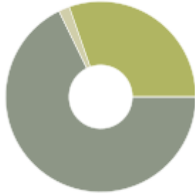
Scope 2 Market-Based Energy