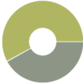
Scope 2 Market-Based Energy