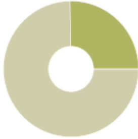
Scope 2 Market-Based Energy