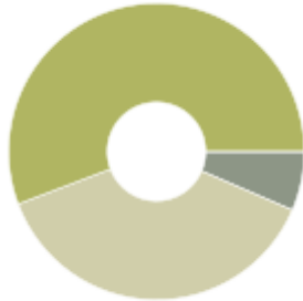
Scope 2 Market-Based Energy