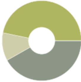
Scope 2 Market-Based Energy